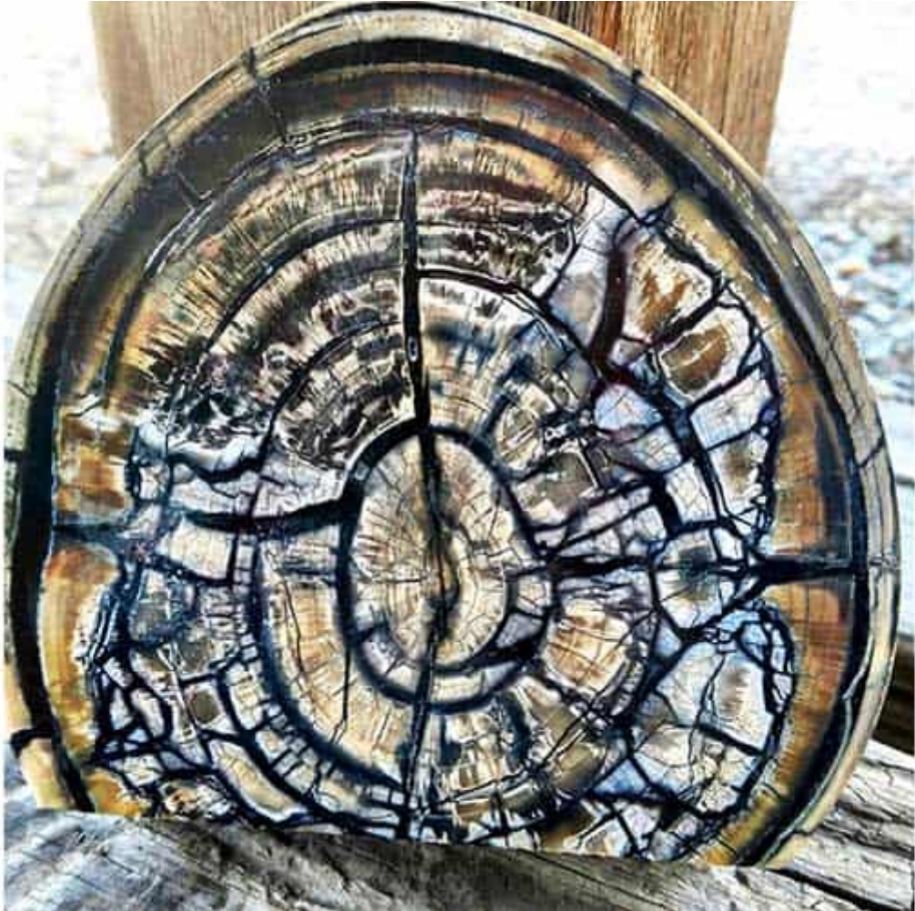
Using the finest mother nature has to offer. Check out this mammoth tusk ivory ready for stocks.