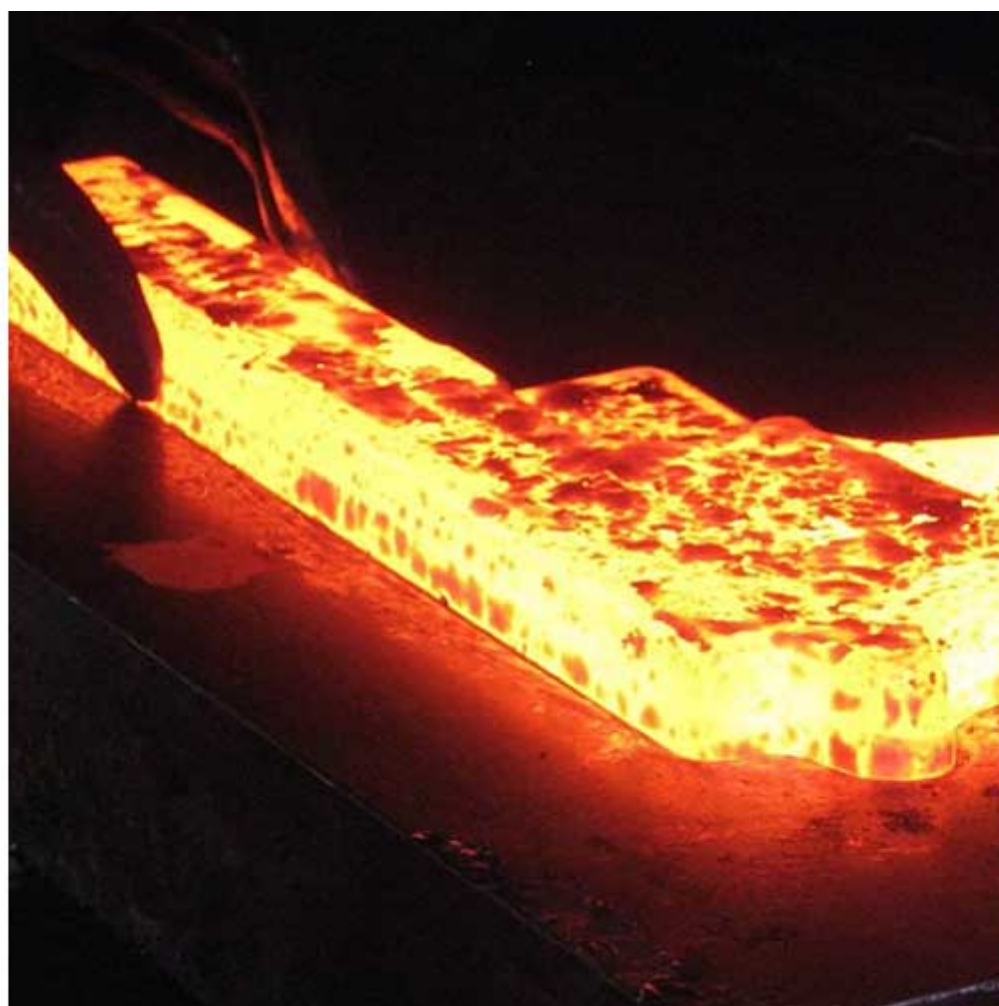
Every Republic Forge 1911 starts out as a 6.5 pound steel billet, heated to 1,400 degrees F, and forged to shape.

The frame is then painstakingly milled on one of two Bridgeport Mills in the Republic Forge Shop. This gets it to its roughly final shape. The same is true of the slide, only it starts out at around two pounds. The parts are then hand-fitted the old-fashioned way, with lots of handwork and that special “feel” only obtainable with hand fitting.